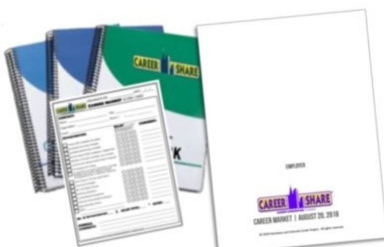
CAREER MARKET TOOLS, DIRECTORY & PLAYBOOK

"Career Market is the most valuable new feature we've seen at career events..." - Advantage Security