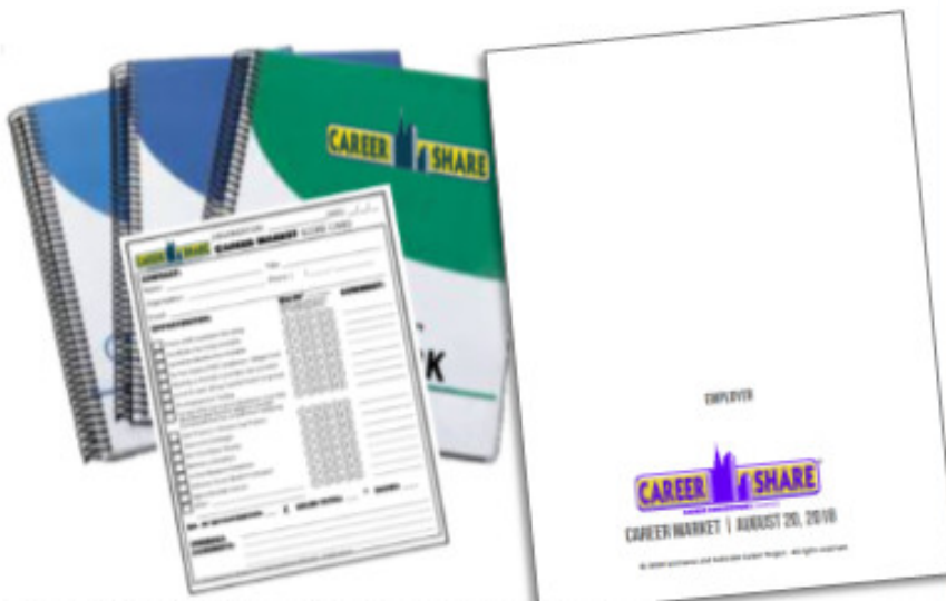
CAREER MARKET TOOLS, DIRECTORY & PLAYBOOK

"Career Market is the most valuable new feature we've seen at career events..." -Major Denver Security Firm (Member)